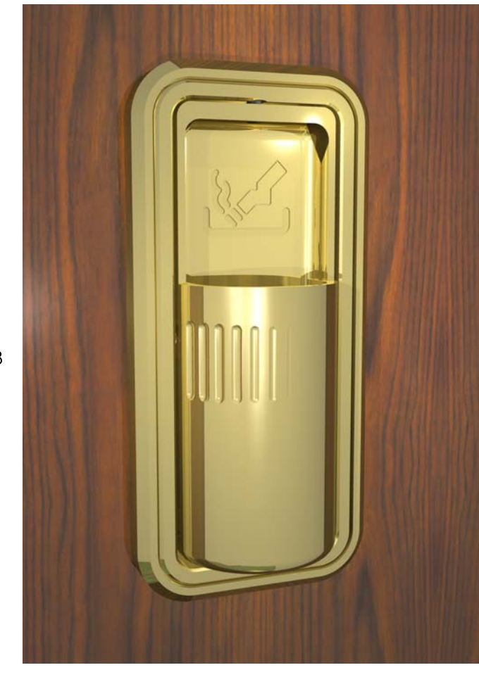
ILLUSTRATION SHOWN WITH A CUSTOMER SUPPLIED ELECTROPLATED FINISH. STANDARD FINISH IS RAW SATIN ALUMINUM READY FOR FINAL POLISHING AND PLATING.

THE DATA OR DESIGNS CONTAINED HEREIN ARE THE EXCLUSIVE PROPERTY OF HORIZON AVIATION GROUP OR CONTAIN PROPRIETARY RIGHTS OF OTHERS AND SHALL NOT BE USED, DISCLOSED, OR COPIED WITHOUT THE WRITTEN CONSENT OF HORIZON AVIATION GROUP.