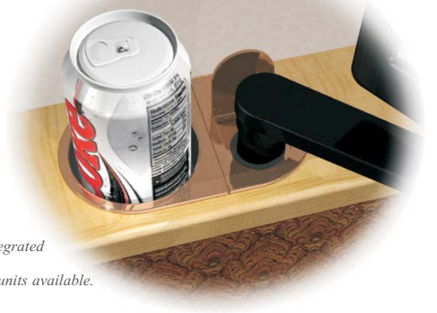
Monitor receptacle cover integrated with a Custom Cupholder™. Other styles and standalone units available.