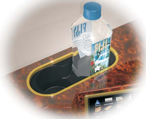
FalconJet tambour-unit replacement provides larger and deeper cupholders at one-half the weight!