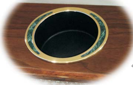
Single place, two-piece Custom Cupholder™ shown with oval rim and optional inlay areas.