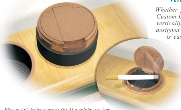
Flip-up Lid Ashtray inserts (FLA) available in sizes to fit cupholders with inside diameters from 2.75" to 3.40". Bottom cups are easily removed for cleaning.