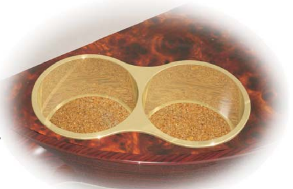
Double place, one-piece Custom Cupholder™ shown with pinched rim and standard cork inserts.

Custom Cupholders™ are available in many different styles, sizes and configurations. One-, two- and multi-piece construction with two insert materials to choose from. Custom sizes and designs are also easily accommodated.