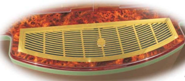
Custom designed and manufactured drip tray with slotted grill option.