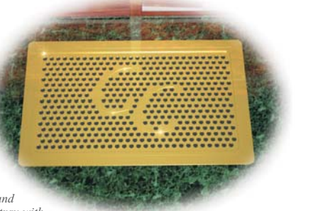
Custom designed and manufactured drip tray with perforated grill style and optional logo.

Each drip tray is custom designed to fit your specific size requirements. The easily removable grill snaps securely into place and is available in one of two different styles.